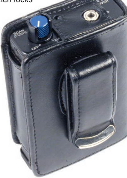
The R1a includes a leather pouch with belt clip to help protect the receiver and provide a way to secure it during use.

The receiver operates on one 9 Volt alkaline or LiPolymer rechargeable battery for up to 8 hours and features a tricolor LED low battery indicator. The voltages are internally regulated for stability.