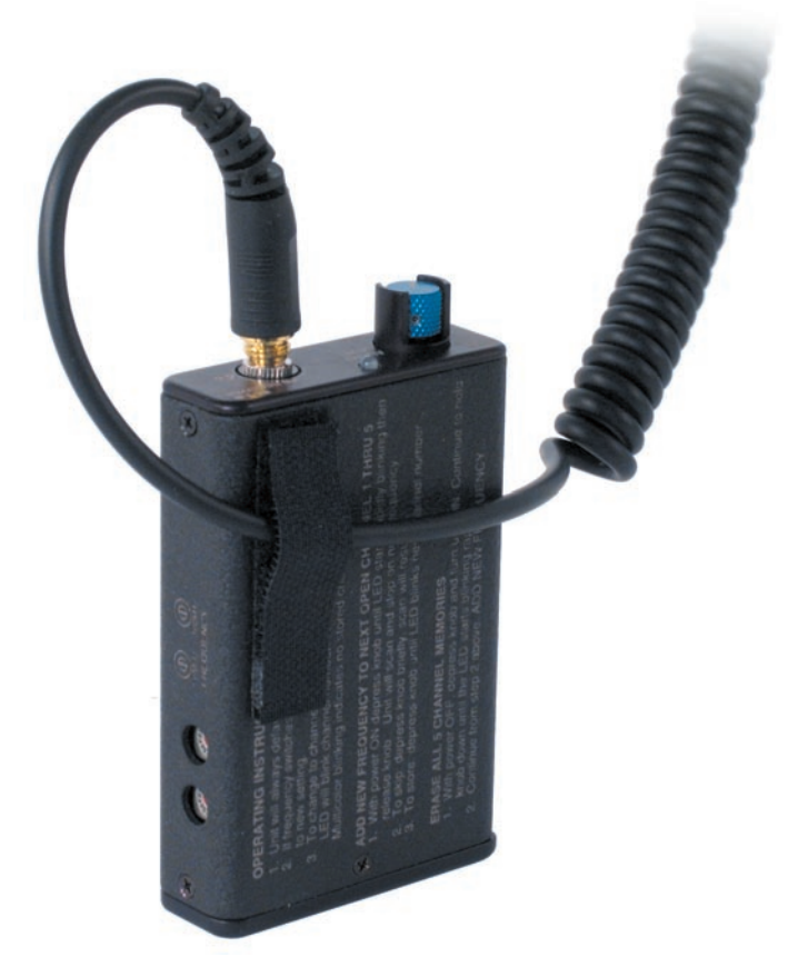
Figure 2 - Headphone cord strain relief