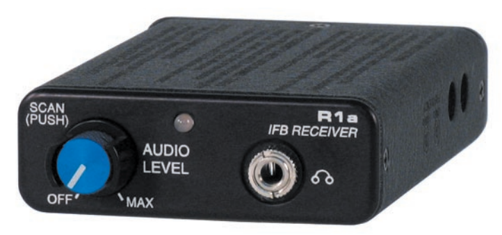
Figure 1 - R1a Control Panel

Refer to the RECEIVER OPERATING INSTRUCTIONS for full details on how to use the single knob control for channel selection, scanning, and programming of the five memory locations.